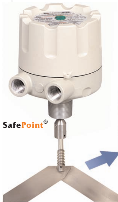
"spring" action collapsible 2-vane paddle